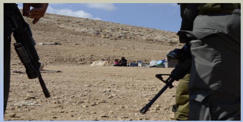
Daily Life .... "Sharing and announcing the universal love of God in Jesus Christ, in particular to the poorest and most oppressed".