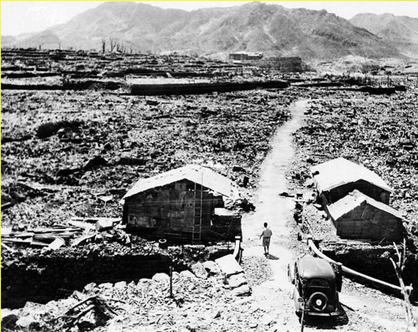
Nagasaki, 9 August 1945